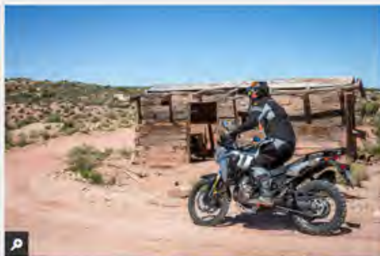
Honda has hit a sweet spot with the Africa Twin in the middleweight ADV segment.

Is the adventure segment in America at risk of burning out? Boot: Black X-Helium